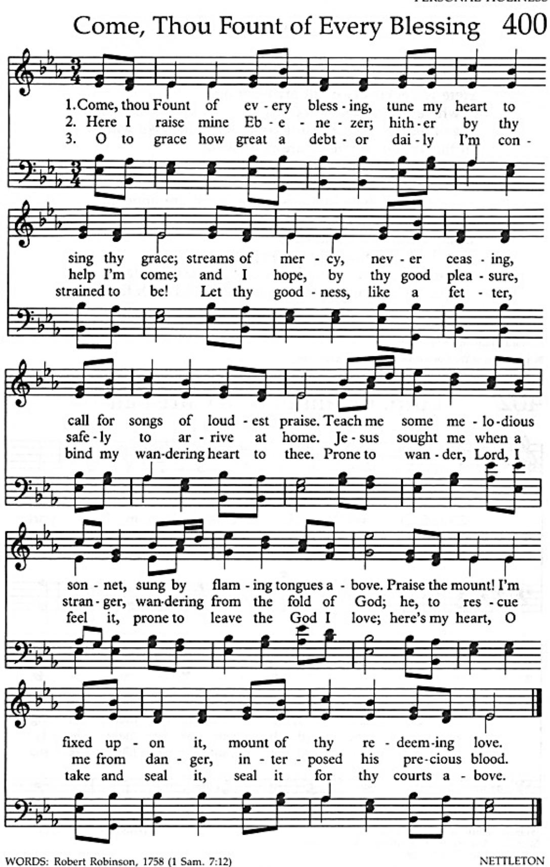
MUSIC: Wyeth's Repository of Sacred Music, Part Second, 1813